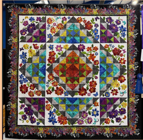
Beth Kendall Viewers choice Best in Show Viewers choice 1 st Place Bed