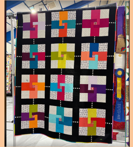
Penny Snyder NACQJ Award of Merit 1 st Modern