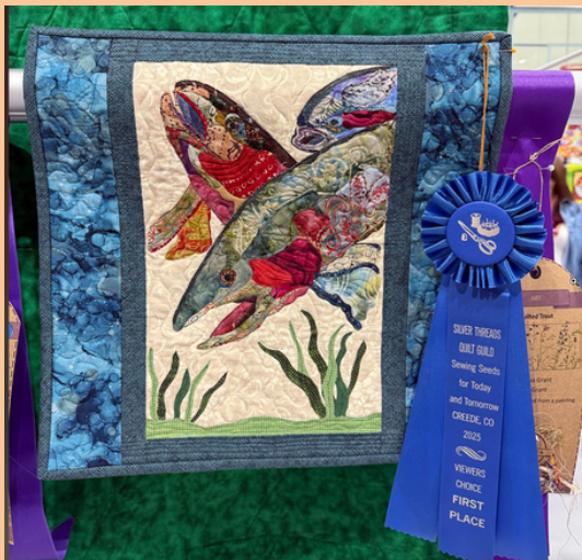
Alicia Grant Viewers Choice 1 st Place Art