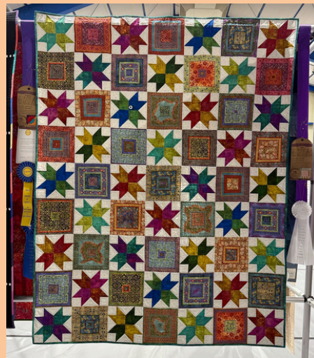
Pat Miller Viewers Choice 3 rd Place modern